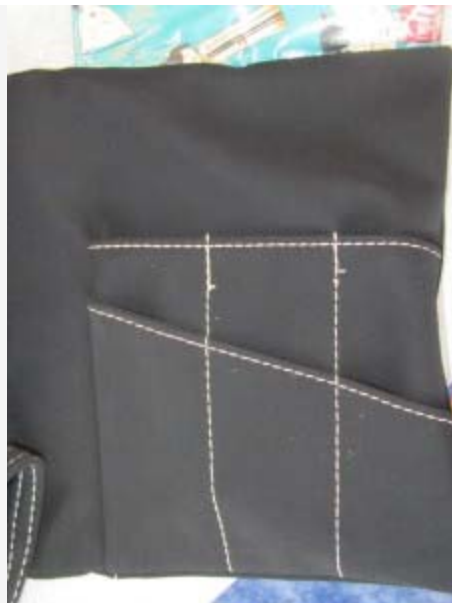
close up of the brush storage area

The covered brush area has six different sleeves, and I could fit several brushes in one sleeve. The largest size brush it holds is 6". The cover keeps your brushes safe and in perfect shape.