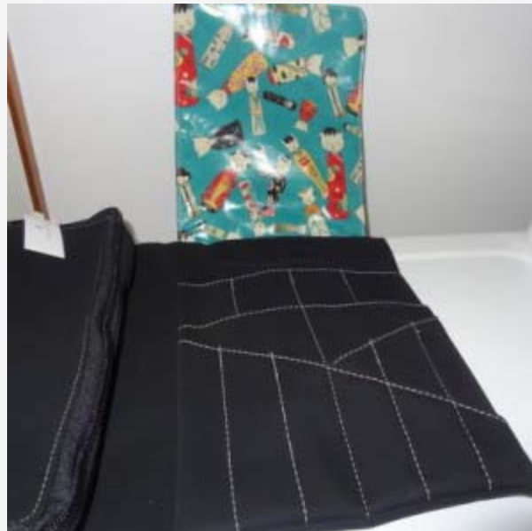
Hold Me bag brush section