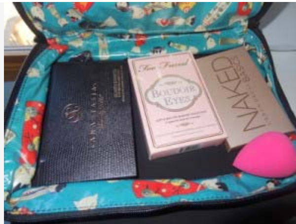
Hold Me center barely filled yet holding 6 palettes

The Hold Me Bags come in 2 sizes (original and baby) and lots of great patterns inside. It brings a smile just to open this bag. This particular size measures 10"H x 7"W x 2"D closed and extends to 22" fully opened. It has room for 15 brushes (though you can get even more in if you have some super skinny ones). The big pocket area holds an amazing amount of cosmetics. My picture shows just a fraction of what I could take.