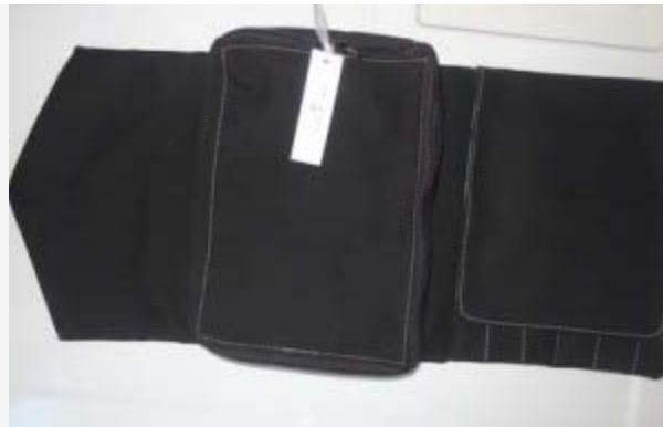
Hold Me bag center