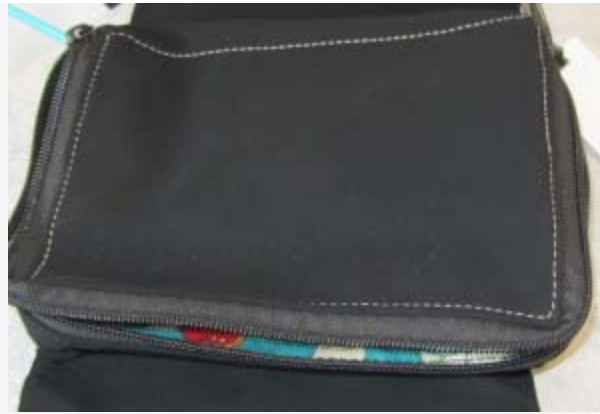
the zippered compartment side

I really appreciate that the center compartment is zippered, plus it comes with a separate liner that you can take out to lay your cosmetics on while using them.