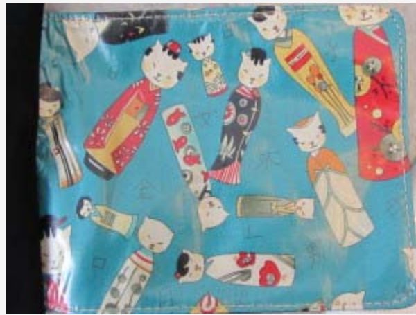
Isn't the liner just too cute??

The colorful liners are made from laminated cotton print and they wipe down perfectly.