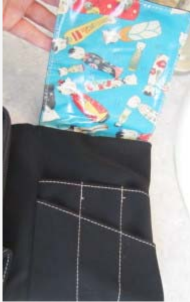
the washable flap covers the brush storage area

The covered brush area has six different sleeves, and I could fit several brushes in one sleeve. The largest size brush it holds is 6". The cover keeps your brushes safe and in perfect shape.