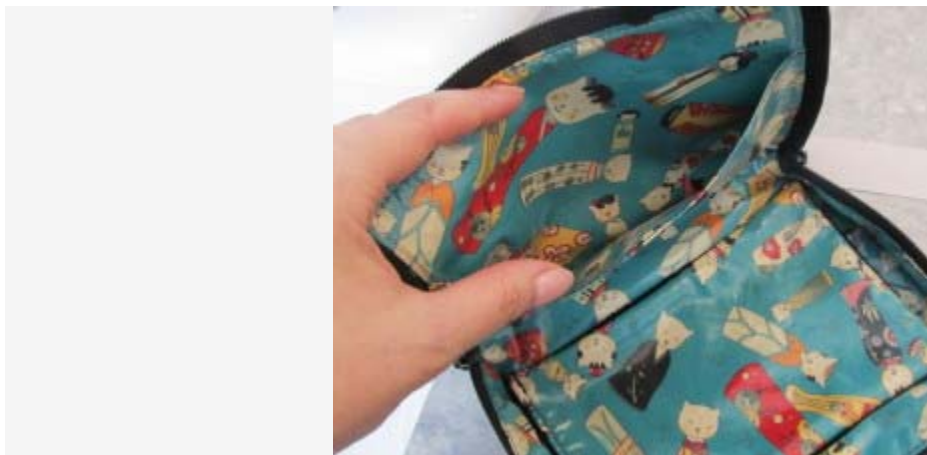
love the pockets

The center section expands and holds quite a bit. When I went on my trip, I had two foundations, one concealer, a loose powder, two cream blushes, two powder blushes, three eyeliners, brow powder, and my small Z Palette.